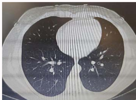
Figure 2: Thorax CT image in transverse section.

Doppler performed with the suspicion of vascular pathology was reported that both popliteal veins were thrombosed until trifurcation and other arterial and venous structures were normal (Figure 1c, 1d). The patient was started on anticoagulant therapy and limb elevation. Electromyography (EMG) was performed after the patient continued severe bilateral leg pain despite analgesic treatment. EMG was reported as normal. Because of the coronavirus pandemic, the patient's nose swab was taken on the possibility of having COVID-19 infection and the Polymerase Chain Reaction (PCR) test was positive. The patient's C-Reactive Protein (CRP), lymphocyte count, ferritin and D-dimer values were within normal ranges. Thorax CT imaging of the patient was also normal (Figure 2). The patient received antiviral treatment Favipiravir, Hydroxychloroquine and other supportive medications for five days. The patient's complaints of knee and leg pain and pseudoparalysis disappeared. The patient was discharged after being treated.